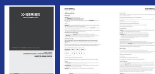
Direct-to-Frame Installation & Construction Details