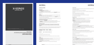
Batten-Fixed Installation & Construction Details