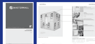
Step By Step Guide

Further details are available on the Masterwall website including downloadable brochures: