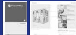
Step By Step Guide

Further details are available on the Masterwall website including downloadable brochures: