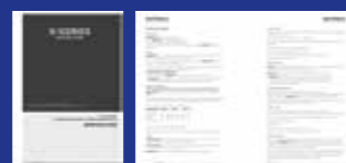
Batten-Fixed Installation & Construction Details

Available online at: www.masterwall.com.au