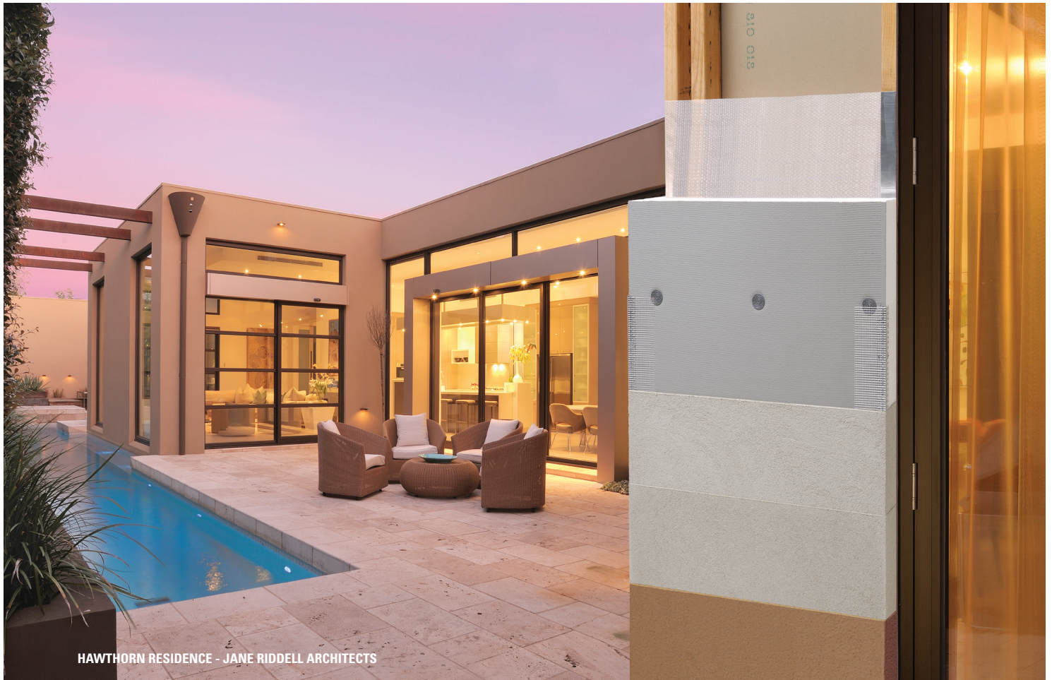
HAWTHORN RESIDENCE - JANE RIDDELL ARCHITECTS

BAL 29, lightweight, reinforced, external insulating wall system incorporating pre-coated panels.